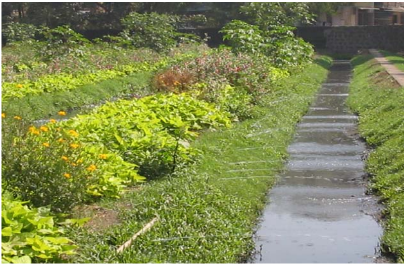
This garden of Ipomeas and Hygroscopic plants, recycles four lakh liters of municipal sewage daily in addition to providing an aesthetically appealing garden

The World Health Organization (WHO) of the United Nations has declared the decade between 2005 and 2015 as critical years to focus global attention on one of our most precious resource: WATER. According to the WHO, more than 1 billion in the world have no access to safe drinking water. This perpetuates a silent humanitarian crisis that kills some 3900 children every day. The Secretary General of the United Nations states: "We shall not finally defeat AIDS, tuberculosis, malaria, or any of the other infectious diseases that plague the developing world until we have also won the battle for safe drinking-water, sanitation and basic health care."