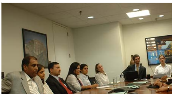
Indian delegates of the Eco housing Tour discuss with members of the US Green Building Council at their headquarters at Washington D. C.

Green buildings are not yet the rule in the United States and Europe, but the movement is growing fast owing to a natural pressure to reduce resource consumption and minimize human impact on the planet. The latest example is the One Bryant Park